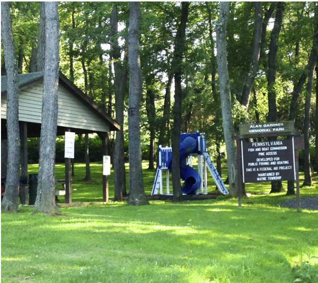
Play Area and Pavilion