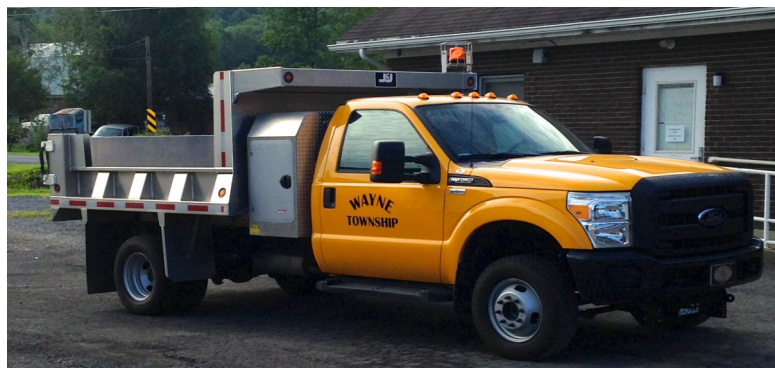
New Township Truck

The Board of Supervisors entered into an agreement with the Clinton County Solid Waste Authority back in 2013 to apply for grant funding from the Pennsylvania Department of Environmental Protection under the Pennsylvania Natural Gas Energy Development Program for the funding to convert the truck to CNG fuel. As part of the agreement with the CCSWA, the Township agreed to use the Wayne Township Landfill's CNG station located on Fritz Road as its primary fuel source for the truck.