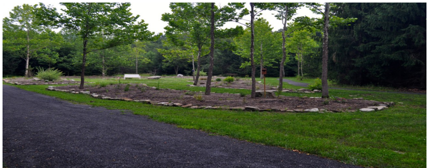
Butterfly Garden at Nature Park

The pavilions are available for rental by calling Don White at 570 769-6993.